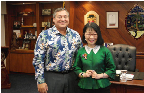
Meeting with Eddie Baza Calvo, Governor of Guam