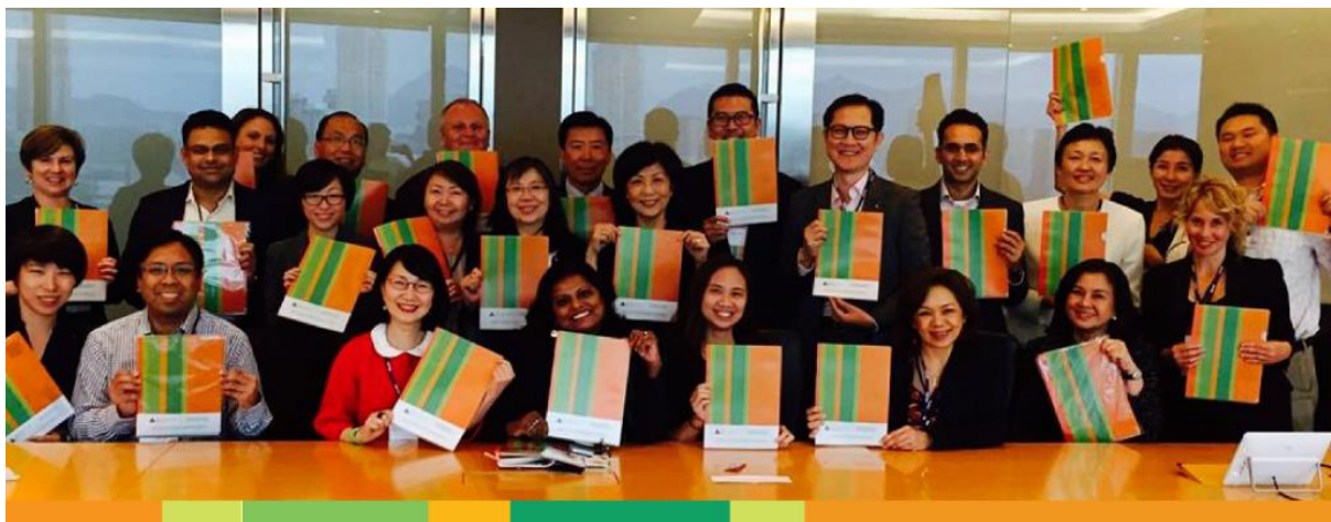
Group photo: JA AP SLT Meeting on June 15, 2016

We had a very fruitful and high impact week of meetings and conference with JA Worldwide, JA Worldwide Board, JA AP Board, and JA AP SLT in Hong Kong from June 15 to 17. Our appreciation goes to all the SLT and delegates support and contribution at the JA AP SLT and extended meetings on June 15 and 16. We are truly inspired and humbled by the work you are doing in all of your respective locations.