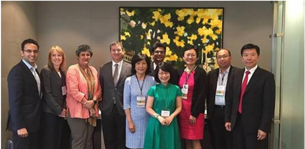
Group Photo: JA AP Board Meeting on June 16, 2016