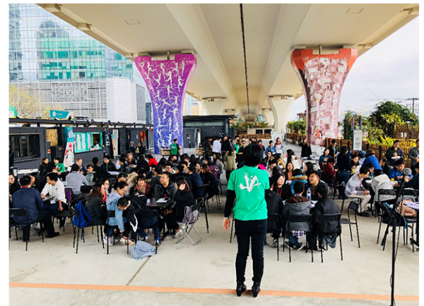
The Schools Challenge Kick-off workshop

Co-organized by JAHK, J.P.Morgan and supported by the Energizing Kowloon East Office (EKEO) of the Development Bureau, the program aims to broaden junior secondary students' interest and learning of STEM and design thinking skills to co-create innovative solutions to transform Kowloon East into a pioneer smart city in Hong Kong.