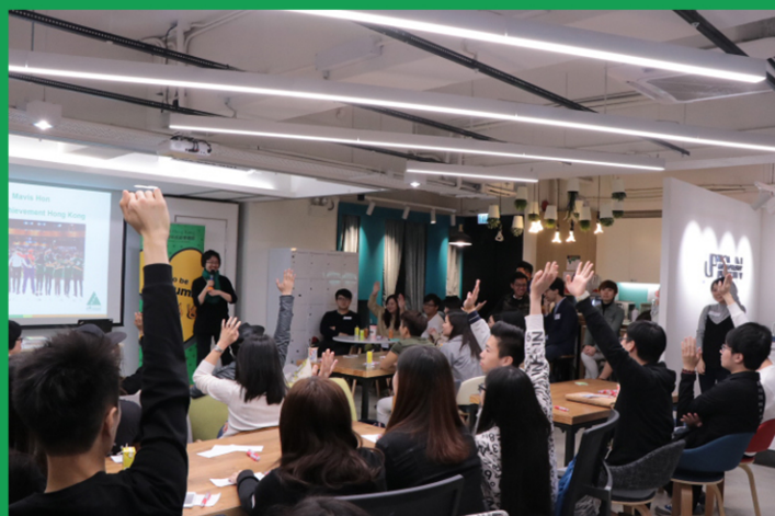
90% of JA buddies are alumni from JA Company Program