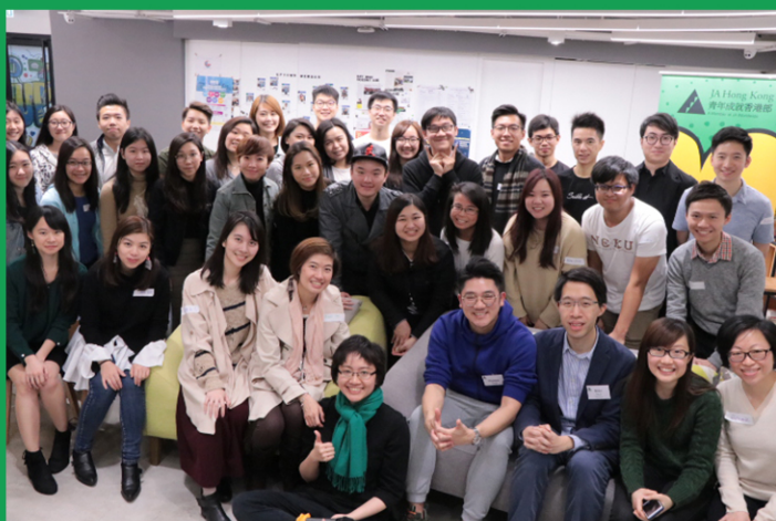
40 JA buddies joined JA Hong Kong Alumni Kick-off ceremony - Hoi Sem Gala