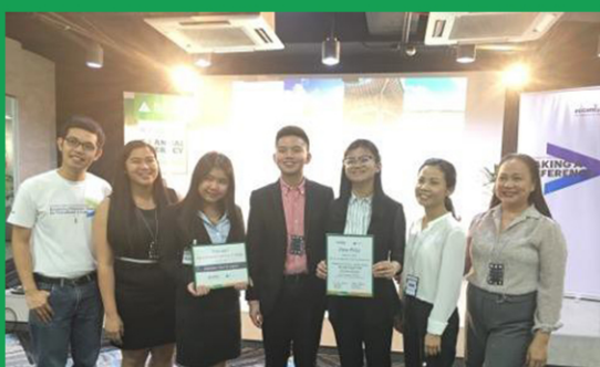
Students team up from Japan, Singapore, and the Philippines

Students from Japan, Philippines, and Singapore team up and emerged as winners in the Travel and Tourism Business (TTBIZ) 2017 Competition.