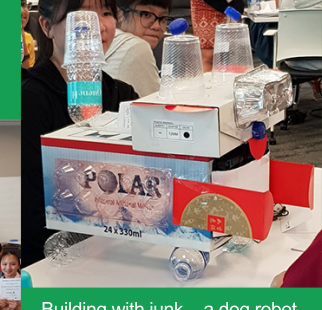
Building with junk – a dog robot

The inaugural WiSTEM2D program seeks to cultivate females' STEM2D interests at an early age and help them continue to grow and develop in these areas, preparing and positioning them to pursue higher education and careers in STEM2D. With this foundation, they are primed to make valuable contributions to their communities, companies, and the world in the decades ahead.